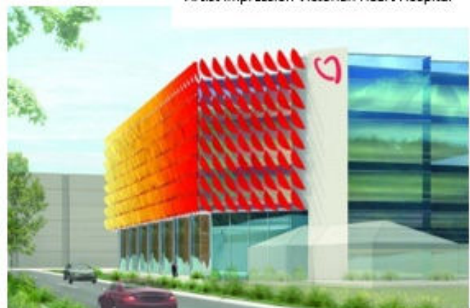
Artist impression Victorian Heart Hospital

Booking Information at Trybooking: https://www.trybooking.com/376198