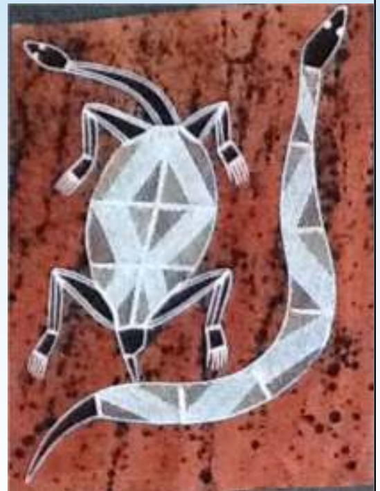
Long Neck Turtle and File Snake by Thompson Nganjmirra