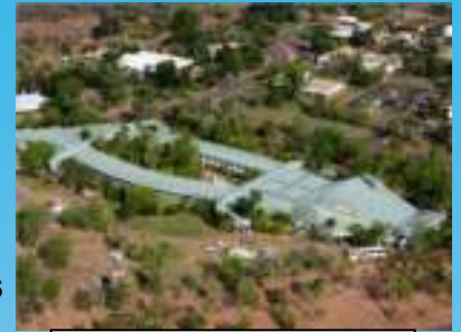
Mercure Kakadu Crocodile

All proceeds from the sale of the art will be donated by Beaumaris Rotary to local community and indigenous projects. Buyers of the art will be supplied with a profile of the artist and a Certificate of Authenticity.