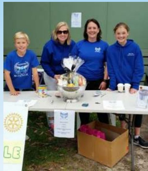
Team from Black Rock Life Saving Club with the hamper they raffled at the last Farmers Market, record ticket sales $690.

Discounted agents fees are available from Hocking Stuart for RCOB Members.