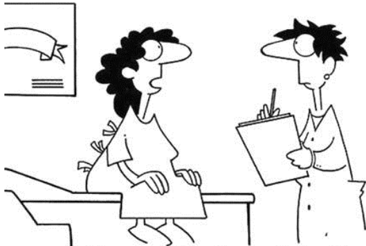
"I have metal fillings in my teeth. My refrigerator magnets keep pulling me into the kitchen. That's why I can't lose weight!"