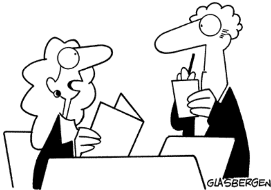
"I'm going to order a broiled skinless chicken breast, but I want you to bring me lasagna and garlic bread by mistake."

Copyright 2003 by Randy Glasbergen. www.glasbergen.com